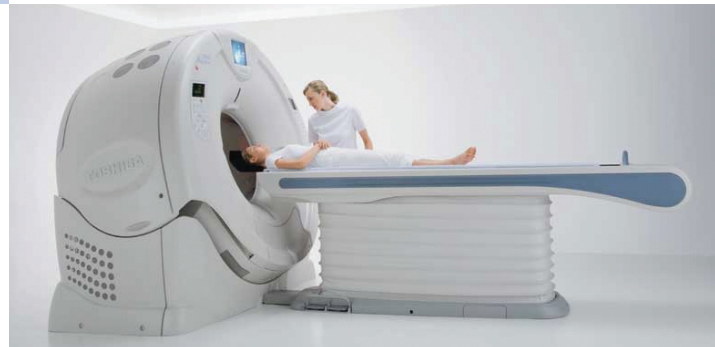
Our new CT Scanner can look inside blood vessels of the heart noninvasively.

If you are 21-75 years of age and are overweight, you might be eligible.